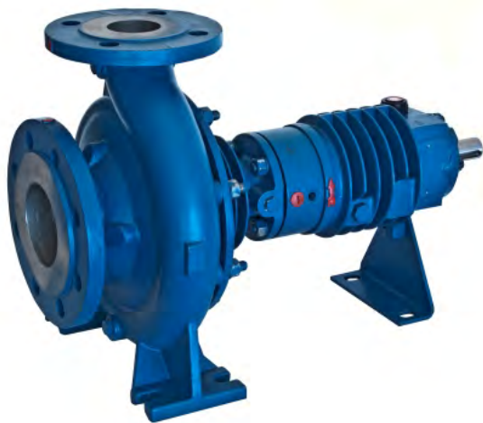
XTP Series (Thermic Fluid)