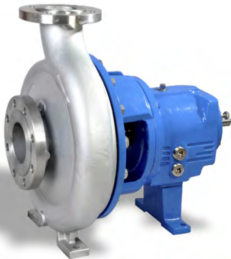
XGP Series (ANSI B73.1M)