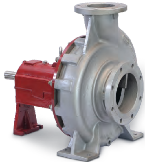
XIP Series (ISO 2858/5199)